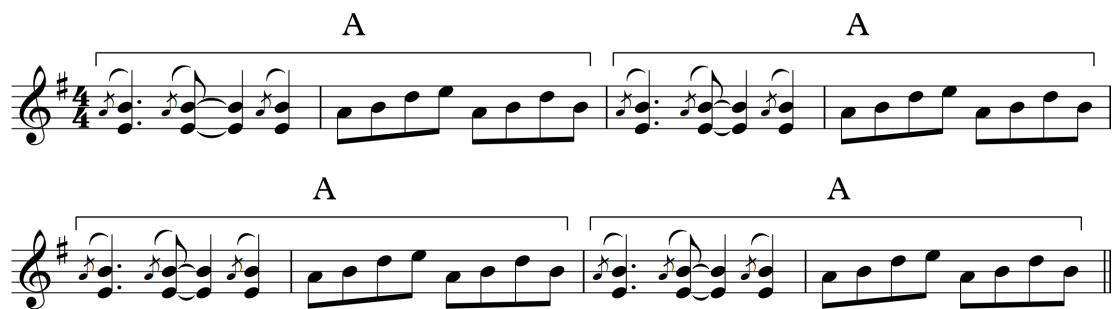
Figure 39: Paranoid - Black Sabbath

AAAA is the simplest form of all; it is based on the repetition of a motif or riff. Figures 39 and 40 illustrates this form in Black Sabbath’s Paranoid (Paranoid, 1971) and Judas Priest’s Victims of Change (Sad Wings of Destiny, 1976)